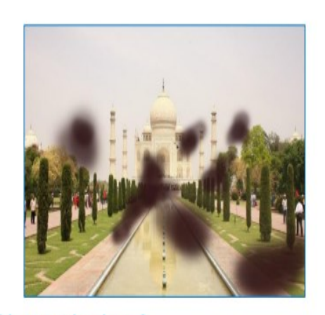
Which vision would you rather have?

For further information visit www.gmsouthdesp.co.uk or call our Bookings Office on 0161 464 3000