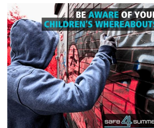
Safe4Summer Greater Manchester