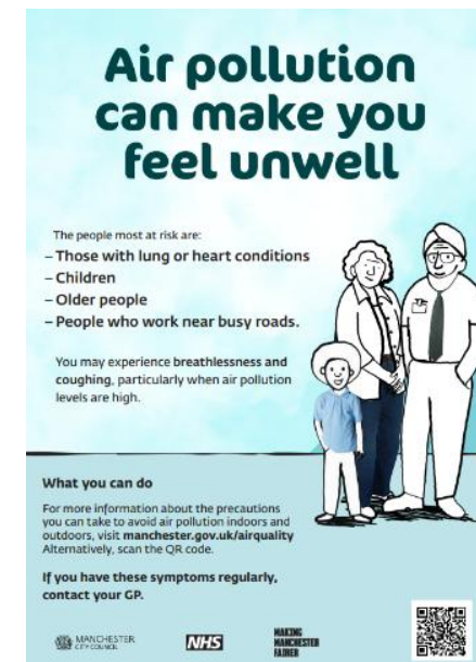
Air Quality - Manchester