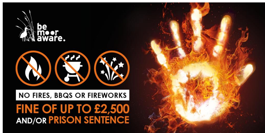
Be Moor Aware - Greater Manchester Fire & Rescue