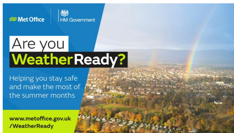
Weather Ready summer toolkit - Met Office