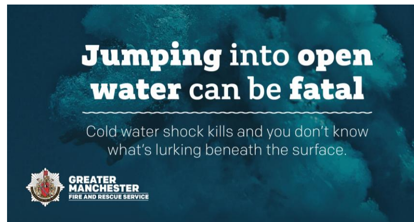
Water Safety - Greater Manchester Fire & Rescue