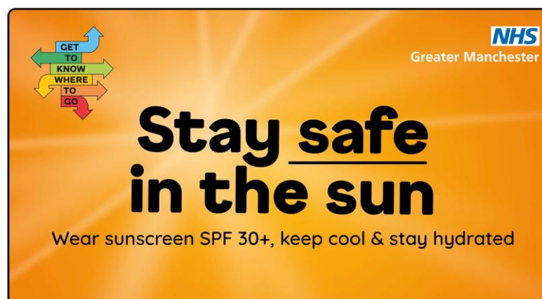
Get To Know Where To Go – NHS GM